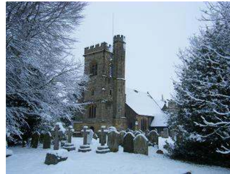
In the bleak mid-winter, the next bleak early-winter was already being thought of at Leigh.

The Editor has attended to a second job of his, and already produced next year's Carol Service poster! (Notwithstanding that it's been next year since about the start of January, but anyway.) After 2011's attractive, but rather ink-intensive festive flower arrangement, it seemed that snow, being also festive and – most importantly – white, would be a good option. So when the snow finally came, what turned out to be a rather snap-happy trip was made to the 2012 Carol Service venue, Leigh [6, 8-2-0 in A]. Alas only one of the resulting 77 photos will be appearing in towers next autumn, but not to waste them all, here in the meantime is a further image from the collection: