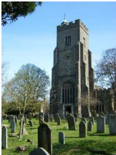
St Nicholas' church, Sevenoaks.