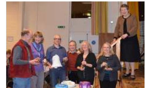
Neeps & Tatties from Hadlow are presented with their prizes.

All in all the evening was its usual great success, with around 140 people attending. The profit going to the KCACR BRF will be £1094 (of which a whopping great £311 came from the raffle), up by 13% on the £964 we raised last year (eat your heart out, Tesco!).