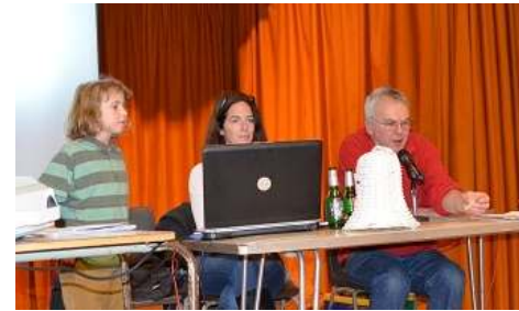
The Quizmeister at work.

for a "prompt" 7:30 pm start, and for the most part they succeeded.